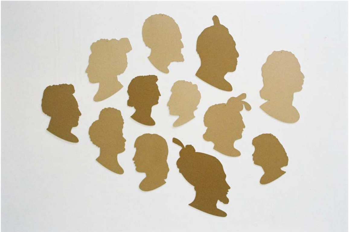
Wayne Youle (NZ) 12 Shades of bullshit , 2003 laser cut acrylic and spray paint