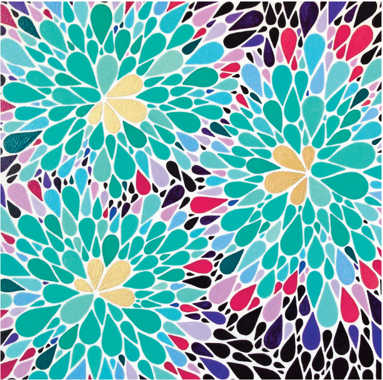
Lara Mann, Roman Candle , 2016, oil & resin on wood panel, 12 x 12 inches

Gallery 2 July 28, 2016 - August 21, 2016