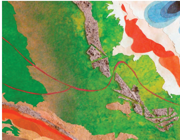
Maggie Puckett, The Scream of the Arctic detail, 2013, handmade paper* (fibers: abaca, flax, cotton, wheat straw, linen, cattail seeds & reeds, desert agave; inclusions: soil, desert sand, beach sand, leaves, red and green marine algae, lobster shell, campfire charcoal; pigments), pva, 9 panels, each measuring 22 x 30 inches *Paper created from fibers grown in garden cultivated by Seeds InService.

Kate Ingold's detailed work examines issues of disturbance, reparation and collapse, and the nostalgia and regret that can accompany loss. Like Ingold, Alison Moyna