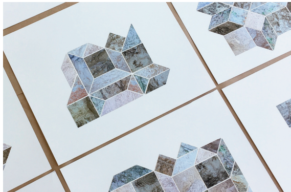
Assaf Evron, Untitled , 2017, pigment print collage, 14 x 17 inches each

Evron works primarily in photographic and photo-based works. He is interested in the directly and indirectly spontaneous, as well as institutional organizing forces. Modernist and minimalist languages are prominent in Evron's work. Evron holds an MFA from the School of Art Institute of Chicago.