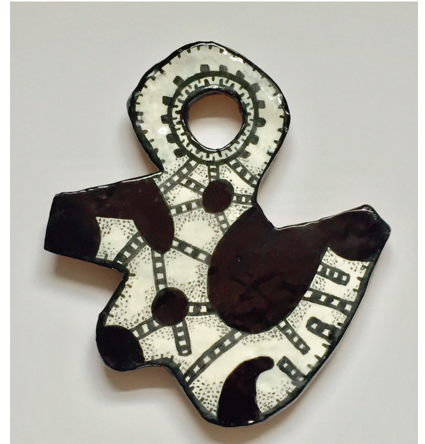
Ruyell Ho, Private Placebo #4 , 2017, ceramic, 14 x 10 inches

Gallery 5 August 4, 2017 - August 27, 2017