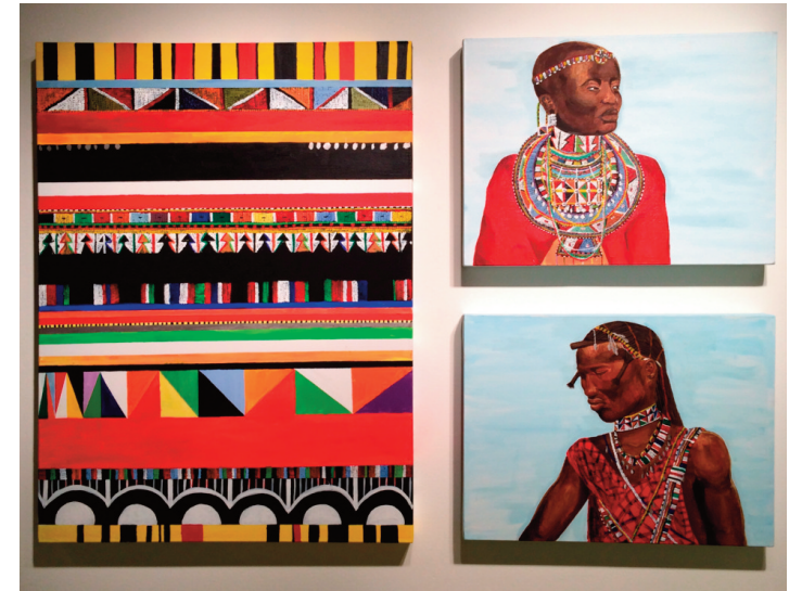
Lamiah Gholar, Maasai , 2015, acrylic and gold leaf on canvas, 40 X 30 inches and 18 X 24 inches (each)

ArtShop is part of a larger education initiative at the Art Center called Pathways, a K-12 learning track that focuses on a core group of South Side schools to develop students' art-making skills, support them in becoming more engaged learners and facilitate the growth of their creative identities. Through Pathways, Hyde Park Art Center works collaboratively with Chicago Public Schools' (CPS) classroom instructors to develop impactful arts curricula that enable students to learn technical art skills and discover how to express themselves creatively. From classroom instruction to individualized mentorship to field trips and free studio art classes at the Art Center, Pathways provides youth artists with a variety of cultural experiences and diverse peer and mentor groups to deliver an innovative, meaningful learning experience.