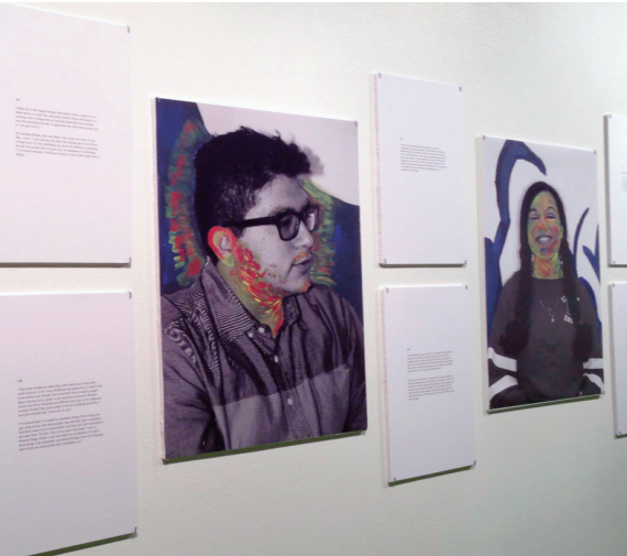
Sydney Falls, Genevieve Liu , 2016, digital print 21 x 15 inches