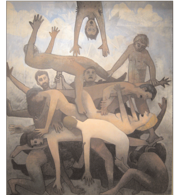
Bradley Biancardi, Social Unrest , 2011, Oil and acrylic on canvas, 108 x 92 inches