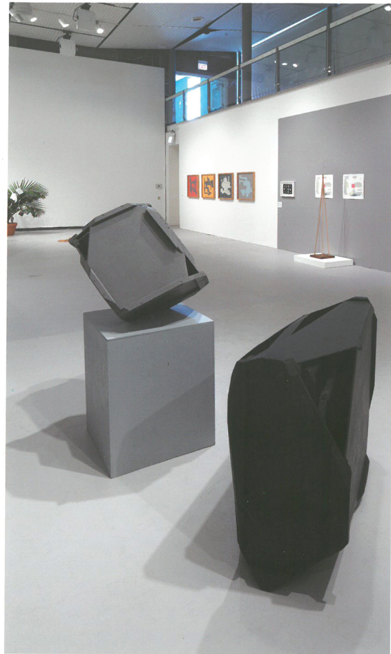
The Chicago Effect: Redefining the Middle , 2014, installation views of interior, Hyde Park Art Center, Chicago