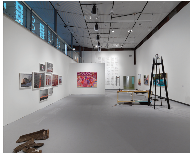
Installation image from Ground Floor

Beginning in 2010, Ground Floor continues the tradition at the Hyde Park Art Center with its survey of artists representing various advance-level art schools offering Master of Fine Art degrees in Chicago. These institutions currently produce the emerging talent influencing the climate of art making here and abroad. This exhibition of multi-media artworks provides a deeper look into our city's pedagogical art institutions, as well as the individual production and budding art practices of the artists selected for exhibition.