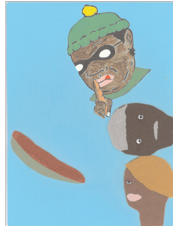
David Leggett, Watermelon Bro , 2011, Ink and collage on paper, 9 x 12 inches (framed)