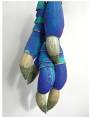
Molluskus Annelida glazed porcelain, 2007 5" x 5" x 14"