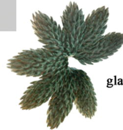
Asteroidea Stapelia glazed porcelain, 2005 10" x 10" x 12"