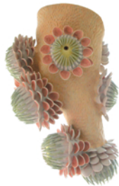
Protea Mus Auris Coralia glazed porcelain, 2005 14" x 11" x 7"