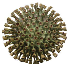
Polyfloral Astrophytum glazed stoneware, 2005 8" x 13" x 13"