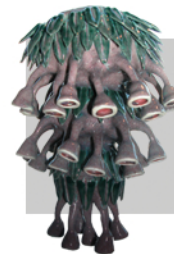
Siphonophore Royale glazed porcelain, 2005 9" x 7" x 7"