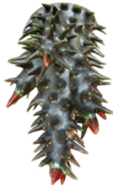
Peutre Pungere Caninis glazed porcelain, 2005 12" x 7" x 7"