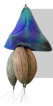
Annelida Molluscoid glazed porcelain, 2007 8" x 5" x 3"