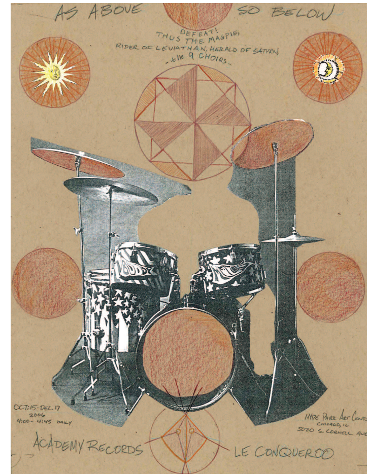
Academy Records Untitled 2006 Mixed media collage 11¾ x 9½ inches