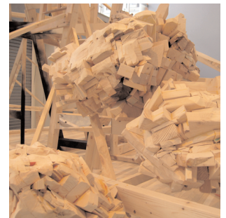
Detail of a geode.

wood follow the same lines that exist on the artist's preliminary sketches, shown to the left. Volume is hinted through the use of black paint to suggest the mountain cavity or caves. Silver paint trickles down a valley of sheet rock and a bright orange hue glows from the inside of the wooden boulders or geodes, as the artist refers to them. These details are used sparingly to preserve room for the viewer to imagine another geological