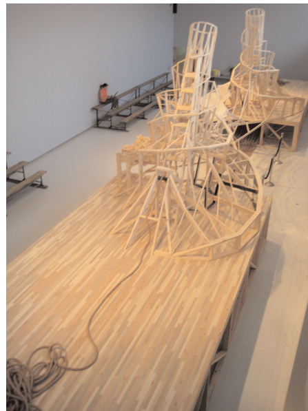
Installation view from above.

Destruction, or the failure of the built structure, is as essential to the artwork as is the viewer's strength or the lumber used to realize the sculptural composition. The artwork is both a kinetic object and a drawing in the way that the pieces of