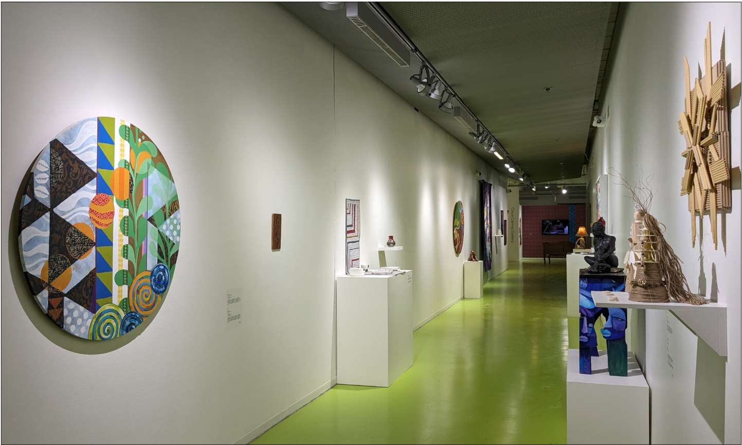
Installation view of Parapluie .