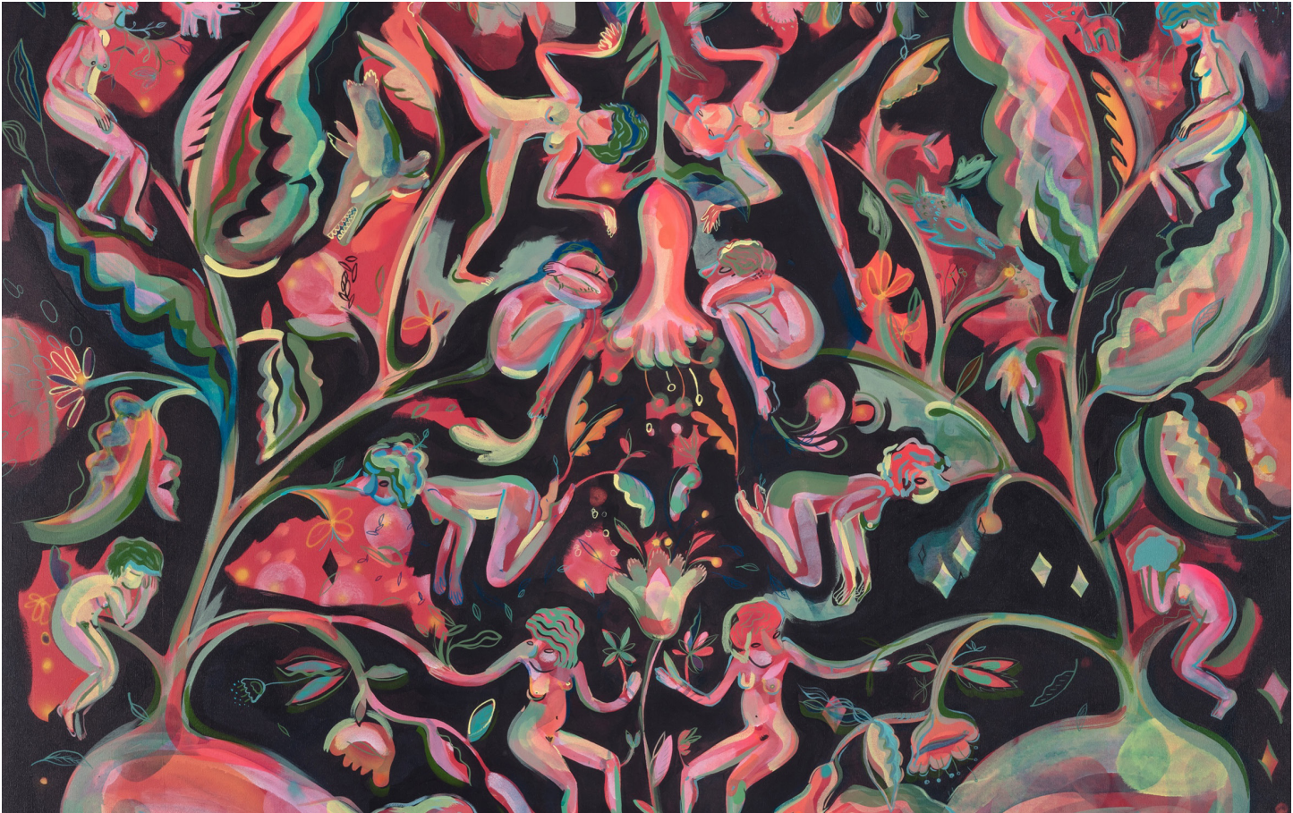
Below: Cecilia Beaven, Inflorescence , 2022, acrylic on canvas, 60 x 72 inches

on site during a Radicle Residency (2021). This exhibition will feature a new temporary mural, drawings, and small clay and papier mache sculptures by Beaven featuring the women-centered worlds she has been illustrating over the past five years.